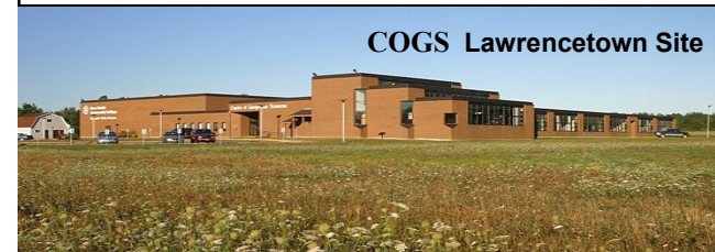
COGS Lawrencetown Site