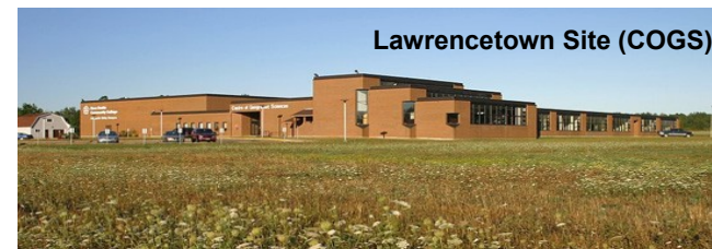
Lawrencetown Site (COGS)

Study Skills Tuition Payment Transcripts Academic Advising Test Proctoring Disability Services Student Association Financial Advising Portfolio Building Student Food Bank Career Counselling Peer Tutoring Counselling Awards and Bursaries Employment Services Bookstore Services Student Email Accounts Housing Workshops and Learning Student ID Print Credits Student Accounts Success Celebrations